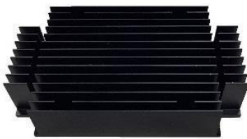
Passive Heat Sink