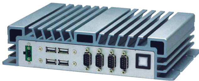
BPC-3040-1A1 front I/O

Fanless Embedded Box PC with Intel® Apollo Lake Pentium® N4200 Processor, Support -20~ 70°C Operation Temperature